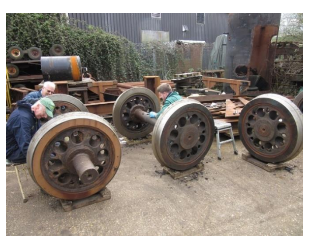
Sidmouth's bogie and trailing truck wheels get a clean up from the team, while 257 Squadron's

Southern Locomotives was also having a working weekend, and both 34072 257 Squadron (yes, it looks just the same as 34092 City of Wells but has a Battle of Britain name – geddit? Well, actually, we believe it was sporting a Battle of Britain (Runner Up) name for the weekend, but we won't go there!) and 34010 Sidmouth – it's a place in the West Country - were having their bits worked on.