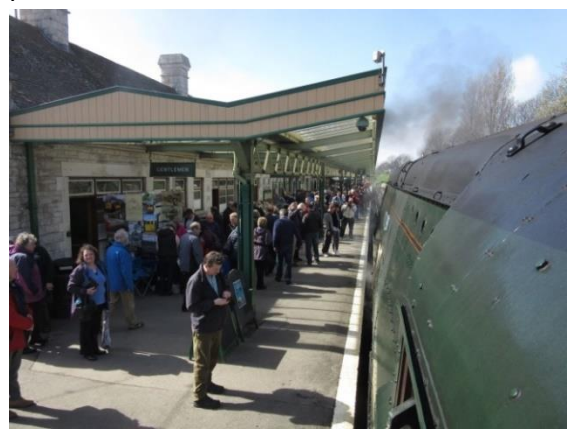
And Norden was worse than this at times!

At Swanage, this is just Friday and the platform is packed.