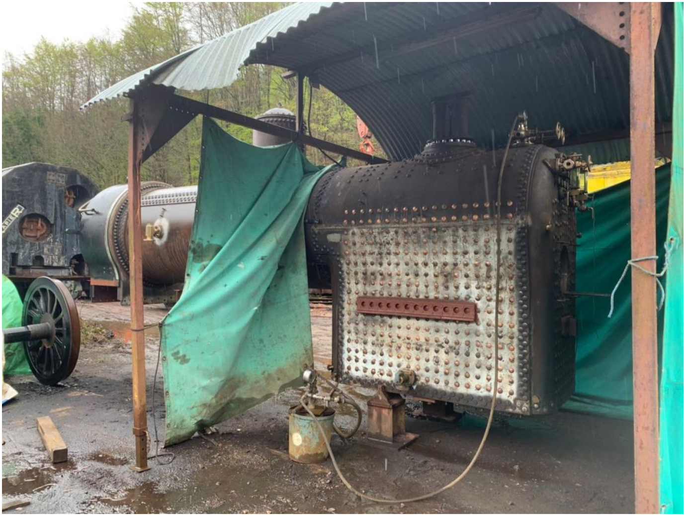
The boiler has a house outside at the Flour Mill Workshop for its hydraulic and steam tests