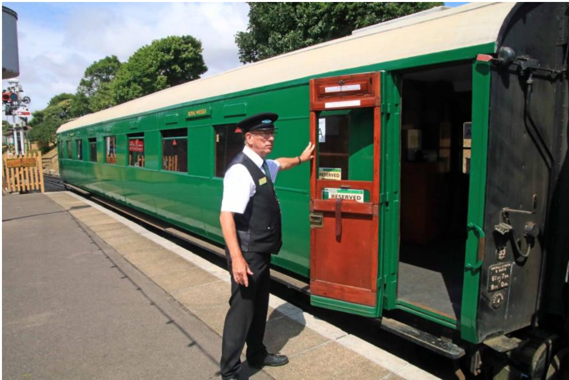
The Maunsell coach S1381, freshly repainted and carrying the roof boards seen in the previous picture.