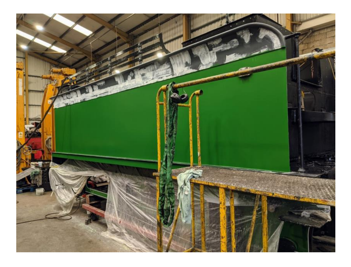
The T3's tender is in Herston Works getting its topcoat.