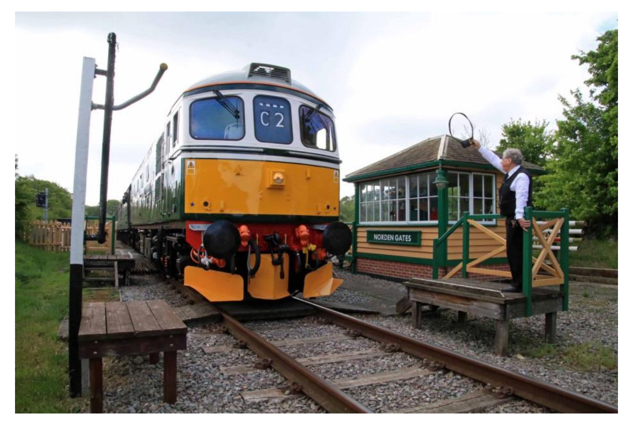
Many of the trains were routed along the extension section to the railway's limit of operations at Frome River bridge 4, with a loco at each end.

Above, Norden crossing keeper Paul Clements is ready to exchange single line tokens with the loco crews as class 33 D6515(aka 33 012) crosses the Wytch Farm Road with a service for Bridge 4.