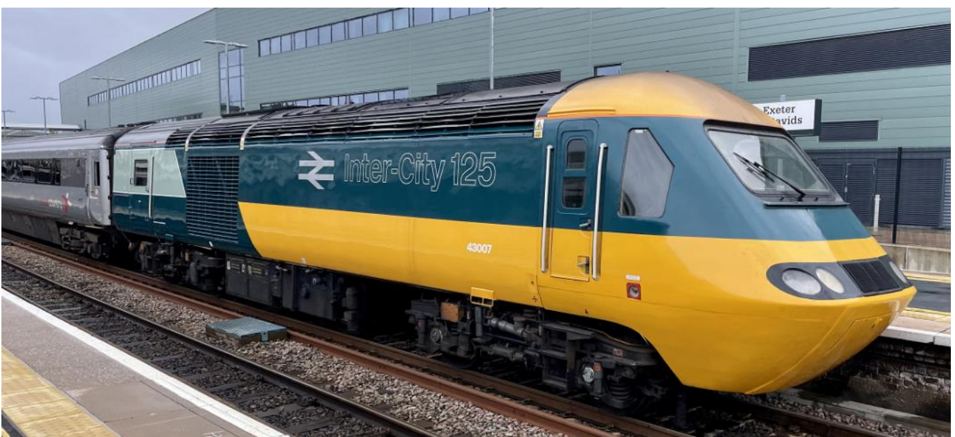
HST at Exeter St Davids.

If you have skills that would enable you to carry out one of these roles, and want to work with others in a team, please consider an application. Further, more formal advertising will be taking place for some of the roles, which can be seen on HOPS or srstaff (for members & staff with access to these restricted sites) OR please email: iwanttovolunteer@swanagerailway.co.uk